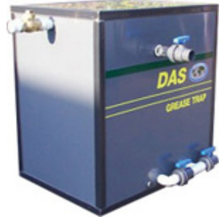
DAS GREASE TRAP™

The DAS Grease with easy to used Cleaning Systems and stainless steel feed pump.