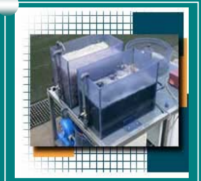
AMB BIO MEDIA™ BENCH PILOT UNIT

AMB Bio Media™ provides flexibility in design and use for aerobic, anoxic and anaerobic systems.